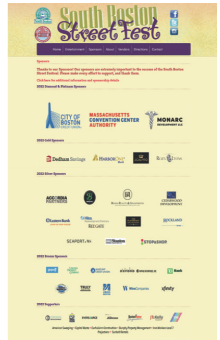
South Boston Street Fest website: southbostonstreetfest.com