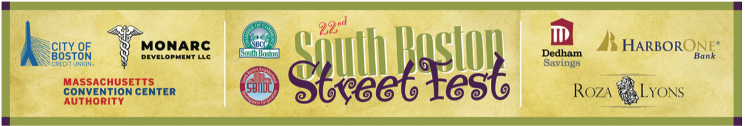
Event signage: 2 stage-top banners (Diamond, Platinum & Gold sponsors only)