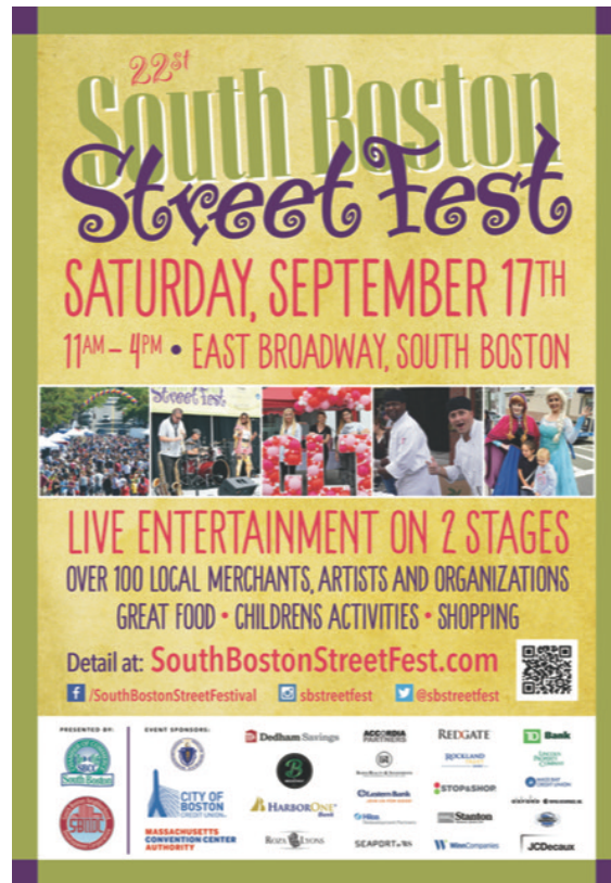
Outdoor media: 20 bus shelter posters throughout Boston (all sponsors)