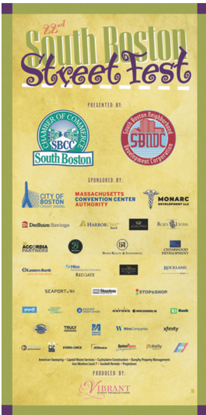
Event signage: 2 4x8-foot stage-side signs (all sponsors)