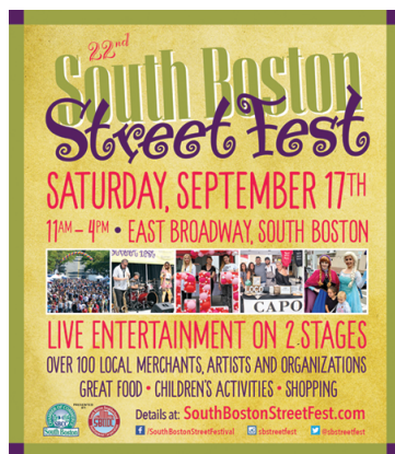
Social media: Facebook, Instagram, Twitter